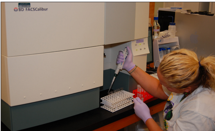
A flow cytometer is used to analyze bacteria, archaea and viruses collected after the oil spill.

Phytoplankton, like land plants, produce organic material from carbon dioxide (CO 2 ) and sunlight to form the base of the marine food web . Single-celled micro-organisms, like bacteria and archaea, are able to convert organic matter, including the organic compounds found in oil and dispersants, into energy and CO 2 , which can then be used by organisms such as phytoplankton. Both the oil and the dispersants may have toxic effects, but may also alter the microbial community by stimulating growth in the portion of the community capable of metabolizing (breaking down) this carbon rich material. However, the growth of these microbes may be controlled by the availability of oxygen and nutrients such as nitrogen and phosphorous. The introduction of carbon-rich, but nutrient poor, organic matter from the Deepwater Horizon oil spill could result in a shift in the diversity of the pelagic microbial community. This change could then translate into a shift in the functioning of the microbial loop (essential to the marine food web) and therefore interrupt the transfer of carbon to consumers in the food web.